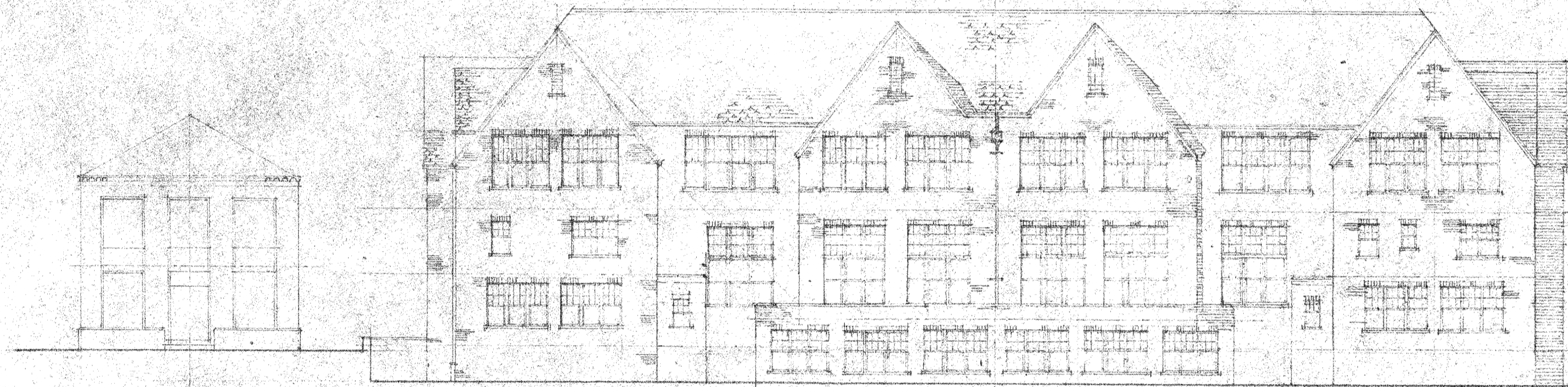
WEST ELEVATION SCALE 1/16" = 1'-0"