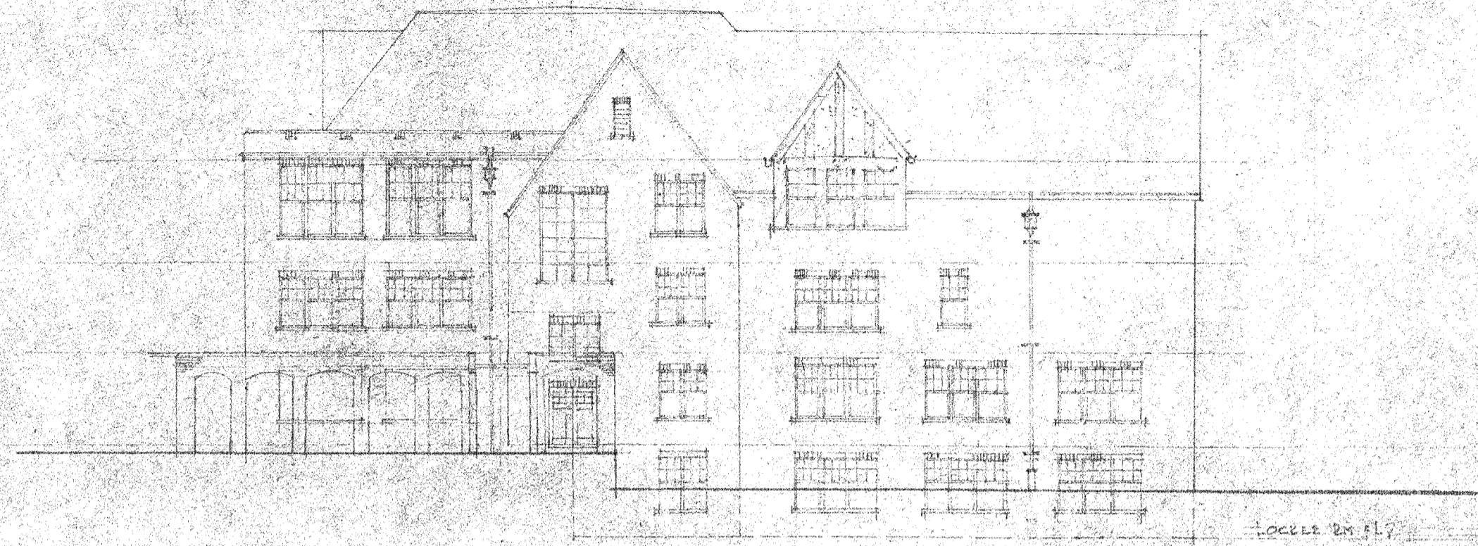
NORTH ELEVATION SCALE 1/16" = 1'-0"